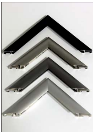
PNR 1380-series • frame shapes