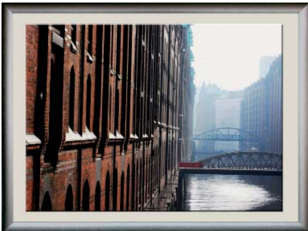
PNR 1380-series • Picture Frame

Picture frames are used as a decorative element on all kind of monuments. The look, convenient feeling and the impression of the destination is a key to serve a warm and save mood during the journey. Picture Frames are composing a comfortable solution to promote the branding of your airline fleet.