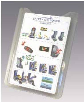
PNR 1240-08 • Check list holder

Checklist holders are made of clear transparent ore colored polycarbonate. The material is in compliance with EASA/FAR 25.853. Due to non-standardization of checklists many variants of holders exist or will be customized.