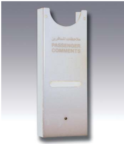
PNR 1240-51 • Holder for Passenger comments

Card holders and timetable holders are made of clear transparent polycarbonate. The material is in compliance with JAR/FAR 25.853(a).