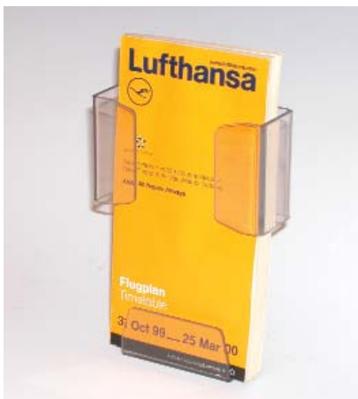
PNR 1240-01 • Timetable holder