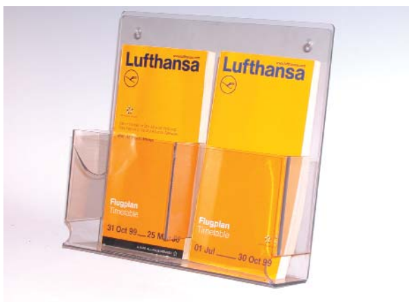
PNR 1240-57 • Twin holder