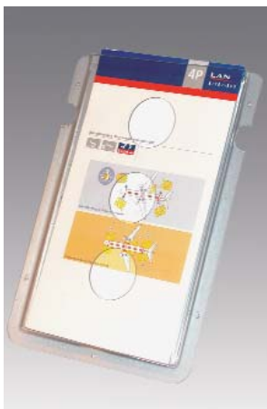
PNR 1240-11 • Check list holder