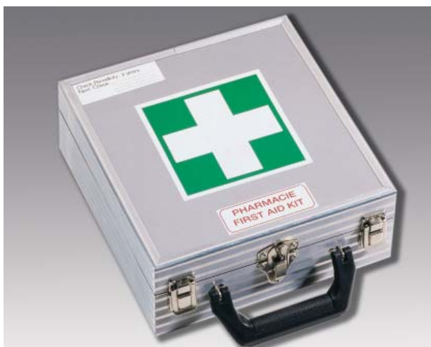
PNR 6240-series • First Aid Kit basic

The bracket PNR 6240-01-001 allows installation of the kit at any location. The bracket has been tested in our approved testing facilities for use in all directions (9g).