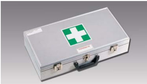
PNR 6240-28 • Emergency Medical Kit

The bracket PNR 6240-01-001 allows installation of the kit at any location. The bracket has been tested in our approved testing facilities for use in all directions (9g).